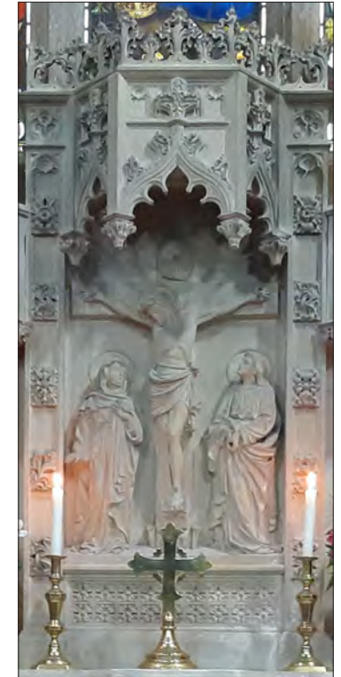
At the top of the cross is carved INRI, short for IESVS NAZARENVS REX IVDAEORVM - Jesus the Nazarene, King of the Jews