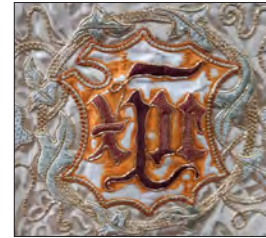
The Chi Rho design is on the Rutleigh cloth - the Greek name of Christ, Chi-rho-iota, or 'XPI'

The stunning designs on our altar cloths are worth a closer look.