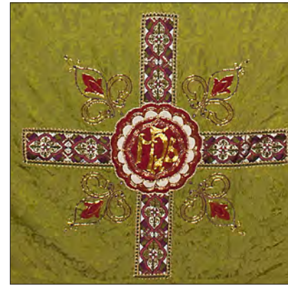
The green cloth used in Ordinary time has IHS (Jesus Hominum Salvator) in the centre of a cross while the red one features a lily