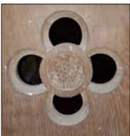
From old French, quatre = four and foil = leaf

A new communion table from Harry Hems' workshop in Exeter was installed in 1885 during major renovations. Quatrefoils carved into the wood echo those on the bench ends. The four overlapping circles may represent the four gospels or a stylised crucifix. The marble altar step was donated by parishioners in 1900.